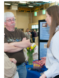
Expo Vendor: Beecher & Bennett Funeral Services