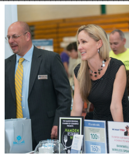
Expo Vendor: Bankwell