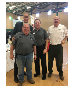
Members of the Chamber Board