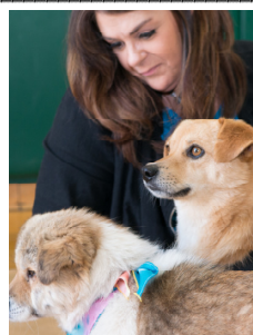
The Animal Haven showcasing beautiful puppies for adoption