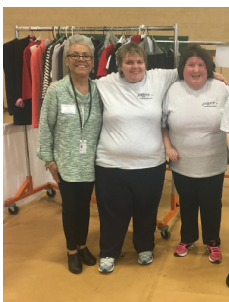
SARAH Employees working helping KC's Closet