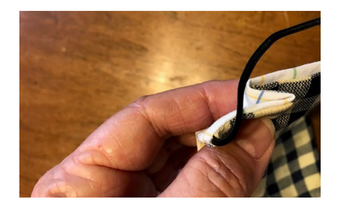
About 1" from the top of the mask, make a ½" fold, then fold back on itself to make a pleat, as shown.

9. Duplicate pleats on the opposite side. Press flat, then top stitch around entire piece, twice. This will really secure your elastic or ribbon ties.