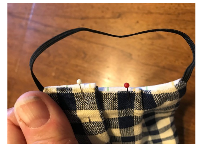
Pin the pleat and repeat 1" from fold of 1<sup>st</sup> pleat to make second pleat, as shown.

Press pleat flat on front and back, again.