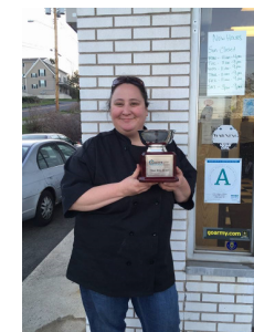
Best Bites Winner JJ's Italian Kitchen