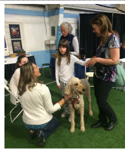
Expo Vendor: Paws N Effect-Therapy Dog Visit