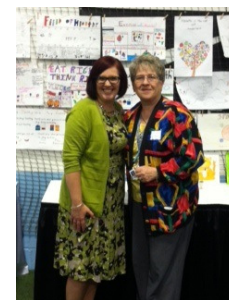
Art Contest from St. Stephens School