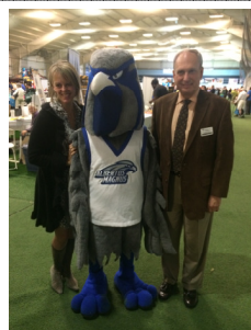
Mascot Wars Winner Albertus Magnus College