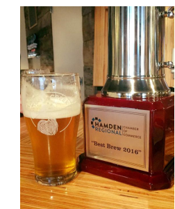
Best Brew Winner Stony Creek Brewery