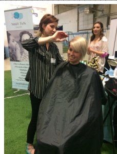
Expo Vendor: Small Talk Salon